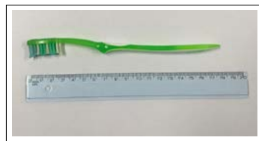
Figure 4. Toothbrush length in centimeters.

Radiographic images can help to identify the object ingested or to evaluate the presence of complications such as pneumomediastinum or emphysema (5) . Up to 34.8% of foreign bodies as food bolus or fish bones cannot be found in radiographic images or endoscopic procedures as spontaneous passage can occur (3) . Some studies report that toothbrushes can be identified in plain radiographic images; however, in the case of our