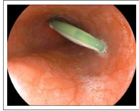
Figure 2. Toothbrush stuck in the lower esophageal sphincter.