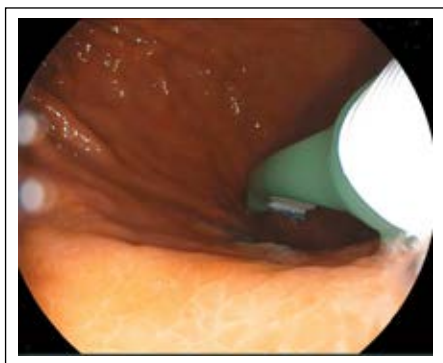
Figure 3. Head of the toothbrush in the greater curvature of the gastric corpus.

The toothbrush length was 18 centimeters (Figure 4). After the procedure the patient presented no complications and was discharged home along with psychiatric assistance.