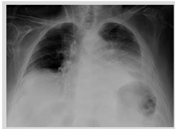
Figure 4. Chest X-ray posterior to octreotide infusion in the second patient.