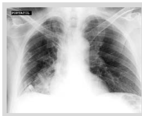
Figure 2. Chest X-ray posterior to octreotide infusion and pleurodesis in the first patient.

A 66-year-old-woman with previous history of obesity and cirrhosis, came to the emergency room with fever and cellulite in her lower limbs. At admission vitals were