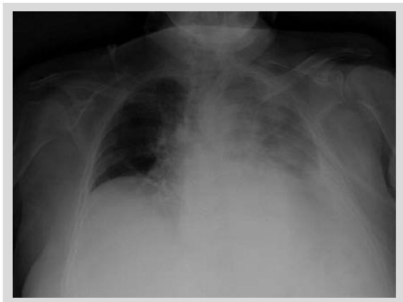
Figure 3. Left pleural effusion in chest X-ray of the second patient when she developed acute respiratory failure during hospitalization.