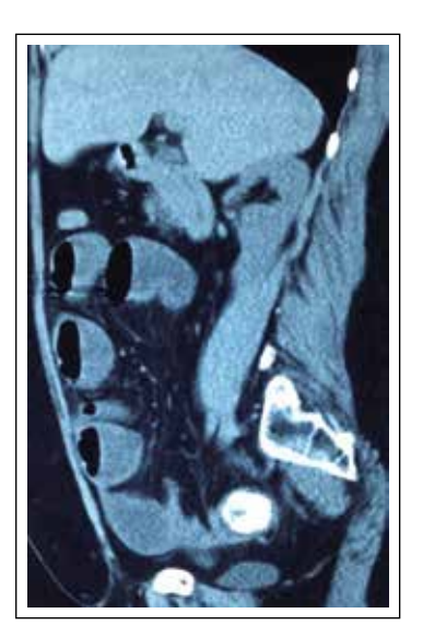
Figure 2. Computed tomography (sagittal section) showing a foreign body impacted in the ileum.

partially viewed, and was well adhered to the first duodenal portion, forming a single block inflammatory which did not compromise the structures of the hepatic hilum. Proximal longitudinal enterolithotomy was done, with subsequent decompression after gallstone extraction (Figures 5 and 6). We choose notto perform the cholecystectomy and the fistula repair. Postoperatively the patient recovered uneventfully and was discharged on the fourth day for outpatient treatment.