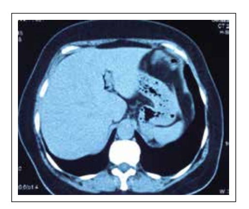
Figure 1. Computed tomography (axial section) indicating the presence of aerobilia.

identified the existence of wide cholecysto-duodenal fistula, allowing internal visualization of gallbladder, discarding the presence of remaining gallstones (Figures 3 and 4).