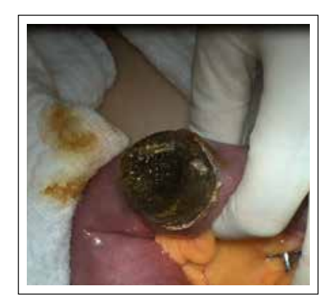
Figure 5. Gallstone extraction through enterotomyin antimesenteric.

inflammatory conditions in the gallbladder, leading to the involvement of surrounding structures, formation of fistulous orifices and further migration of gallstones to the gastrointestinal tract <sup>(4)</sup>. The literature describes three main possible fistulas between the biliary tract and digestive tract: cholecysto-duodenal (65-77%), cholecysto-colics (10-25%) and cholecysto-gastrics (5%) <sup>(5)</sup>. Consequently, the symptoms become varied, as the gallstone may lead to obstruction of any segment of the digestive tract, proximal and distal.