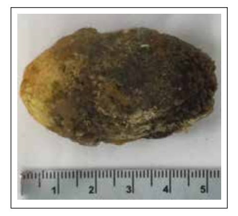
Figure 6. Gallstone measuring 3 cm x 5 cm.

The distal ileum, due to the small size and weak peristalsis, is the most frequent site of obstruction <sup>(9)</sup>. The symptoms in this case are typical of small bowel obstruction, including nausea, vomiting, distension, dehydration and abdominal pain. The Riegler's triad (aerobilia, distended loops and ectopic gallstone), set of highly suggestive biliary ileus signals, is observed in only 15% of the radiographs, which leads many patients to surgery without a predetermined diagnosis. Aiming to a more accurate diagnosis, computed tomography (CT) can demonstrate Riegler's triad up to 80% of cases <sup>(10)</sup>. Therefore, the image provided by CT is crucial not only for the diagnosis of biliary ileus, but also to helpingin the therapeutic decision <sup>(11)</sup>.