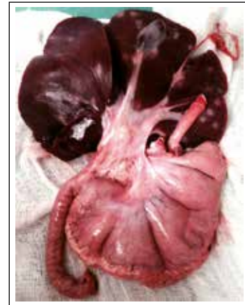
Figure 1. Dissection specimen displaying the model of specimen in use: esophagus, stomach, duodenum, pancreas, liver, and gallbladder.

A total of 50 endoscopists with basic proficiency in the procedures and enrolled in the XIV Brazilian Digestive System Week (SBAD in Portuguese), held