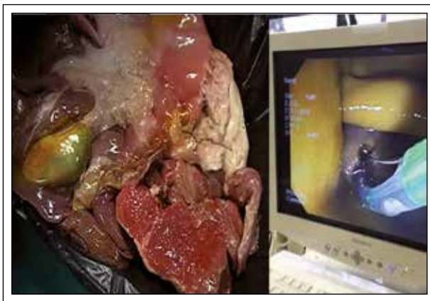
Figure 2. A) Specimen. B) Station.

Model: The standard ( ex-vivo ) model was made of en-bloc specimen from porcine digestive tract, which was dissected and prepared by associating surgical and anatomic techniques, and that included esophagus, stomach, duodenum, pancreas, liver, and gallbladder. Specimen preparation: The specimen was thoroughly cleaned inside the digestive tract to remove food residues and later placed inside a plastic mannequin with the proximal esophagus attached to its mouth orifice. In the second portion of the duodenum, at the mesenteric border, a window with approximately 1 cm in diameter was created and, at this site, duodenal