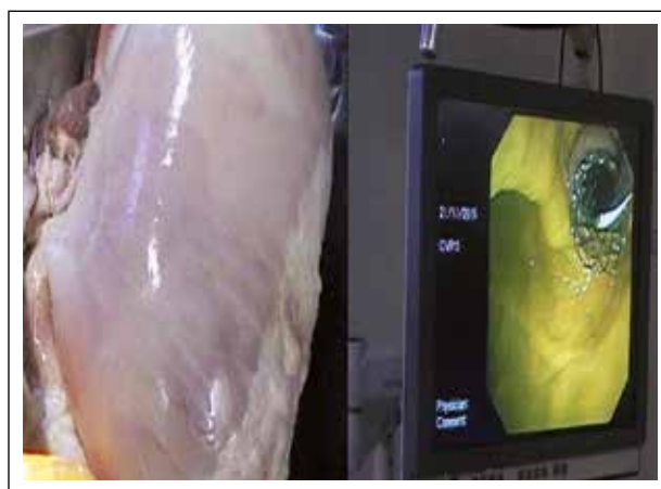
Figure 6. A) Specimen. B) Station.