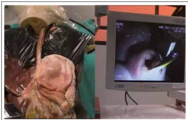
Figure 10. A) Specimen. B) Station.