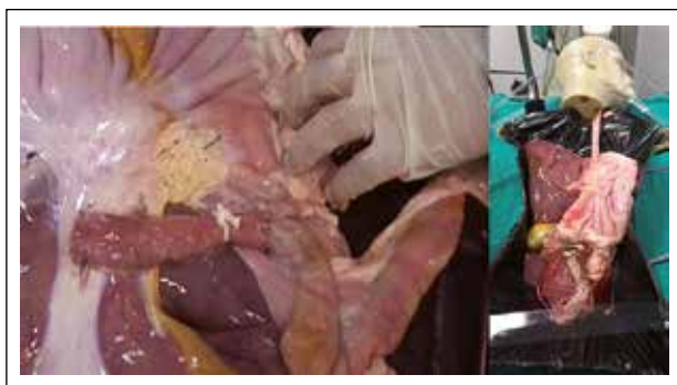
Figure 4. A) Specimen. B) Station.

Every student had the opportunity to perform and assist in procedures, which in some extent enabled reinforcement of maneuvers, concepts, risks, and complications of every station. Student exchange time and re-preparation of artificial conditions (stenosis, bile duct stones) took less than two minutes in a regular and systematic manner. It is important to emphasize that the maneuvers in this experimental model were performed with no fluoroscopy guidance and this fact did not hinder learning by students whatsoever (Figure 4).