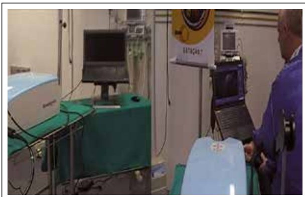
Figure 9. A) Specimen. B) Station.

Model: The standard (ex-vivo) model was made of en-bloc specimen from porcine digestive tract that was dissected and prepared by associating surgical and anatomic techniques, and included esophagus, stomach, duodenum, pancreas, liver, and gallbladder. Specimen preparation: The specimen was thoroughly cleaned inside the digestive tract to remove food residues and later placed inside a plastic mannequin with the proximal esophagus attached to its mouth orifice. Preparation of nodule lesions: On the hepatic lobe in contact with the gastric wall, longitudinal incisions were made and grapes with no skin were placed inside them, mimetizing (metastatic or non-metastatic) hepatic nodules. Incisions were sutured with 2.0 cotton thread in order to maintain the presumed lesions at their due sites. Equipment and accessories: A 7500 series Pentax echoendoscope with EPK-i processor