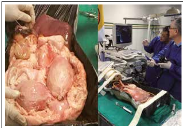
Figure 7. A) Specimen. B) Station.

chamber, every student performed EUS location of cystic lesion and echoguided puncture, respectively (Figure 7).