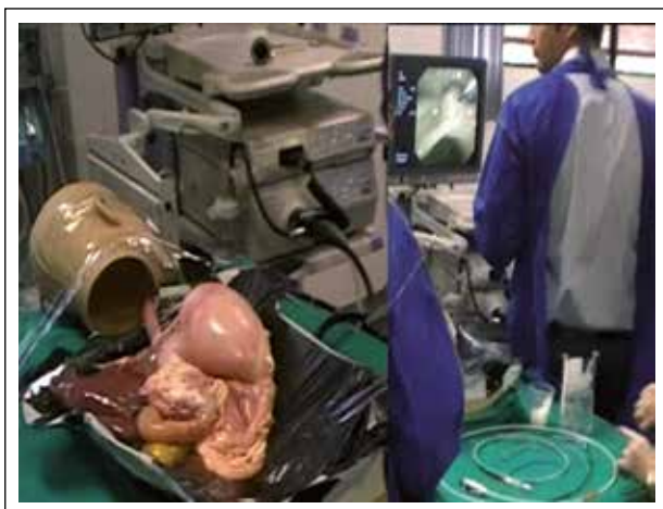
Figure 5. A) Specimen. B) Station.

Procedures: Groups with five to six doctors comprised the station and rotated. A 10-minute limit for procedure time was determined for every student. The 20 final minutes were assigned for every group in the station to reinforce concepts and maneuvers, repetitions for some students, or demonstrations by the monitor. Upon arrival at the station, the monitor provided a brief explanation about equipment and accessories to be used, orientation about the specimen and how the activity would be performed. In this station, the monitor introduced the sector-type echoendoscope and its resources (dimension measurement and power Doppler use) along with concepts about perigastric anechoic image and the echoguided puncture technique, which includes ideal position for punctures, needle type and needle movement. After that, with the sector-type echoendoscope positioned in the gastric