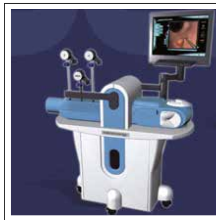
Figure 8. Virtual Simulator, Simbionix.